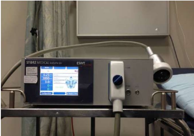
Fig. 1 The LiESWT was performed without local or systemic analgesia using Duolith SD1 ultra (Storz Medical AG, Tägerwil, Switzerland) in the outpatient setting.

As a novel treatment method, LiESWT aims to restore natural and spontaneous erectile function and recent studies showed that LiESWT salvages men who were PDE5 inhibitor non-responders to become PDE5 inhibitor responsive [3]. To our knowledge this is the first Australian clinical study that evaluates efficacy, safety and patient satisfaction rate after LiESWT in men with ED.